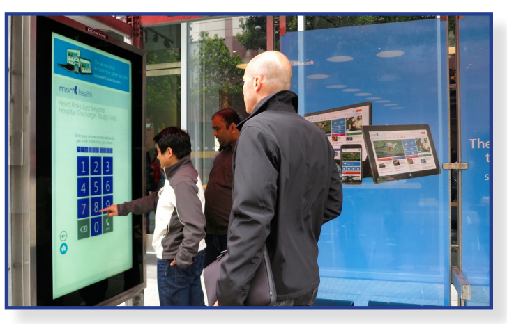
DIGITAL BUS SHELTERS