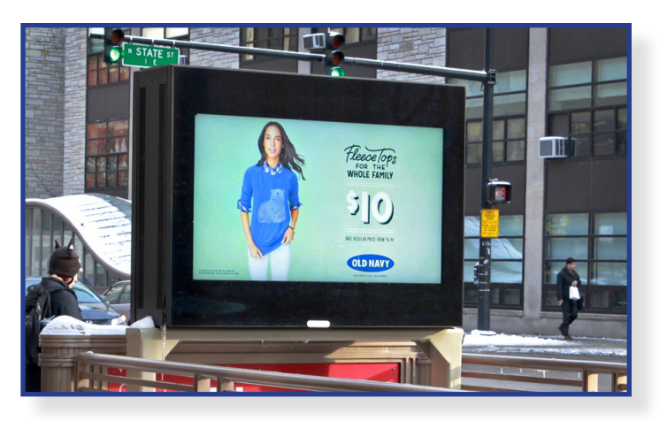
DIGITAL URBAN PANELS