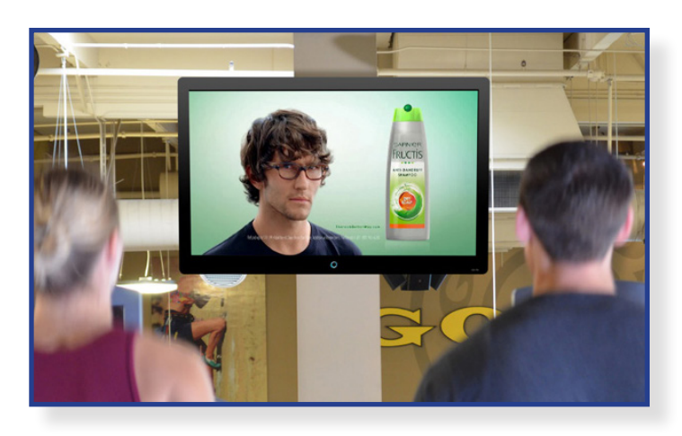
DIGITAL PLACE BASED VIDEO NETWORKS